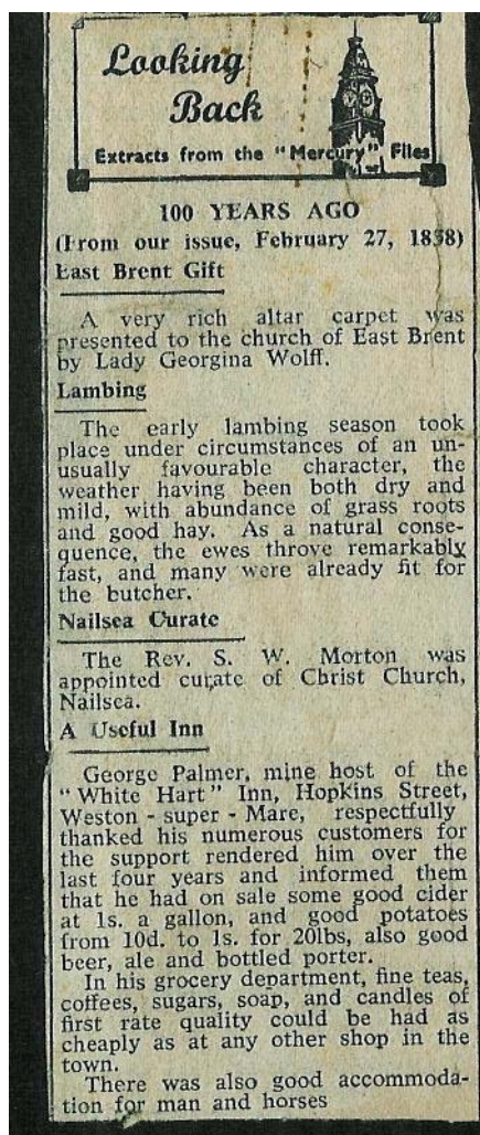
Figure 2 White Hart newspaper clipping